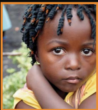
■ DRC has a staggering number of orphans