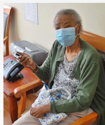
Resident engaging with the audio Scripture

Thank you for making a difference in these most difficult times.