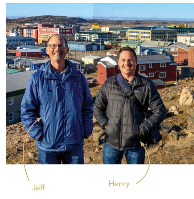
"One night, we headed out to a ridge on the upper level of Iqaluit and saw the Northern Lights which were spectacular. They were almost like a river, but pieces of a river flowing back and forth in different directions on top of us. The Northern Lights change so quickly, suddenly they've moved and formed a different pattern." — Henry